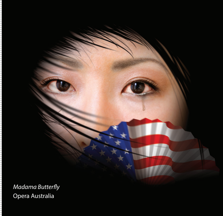
Madama Butterfly Opera Australia